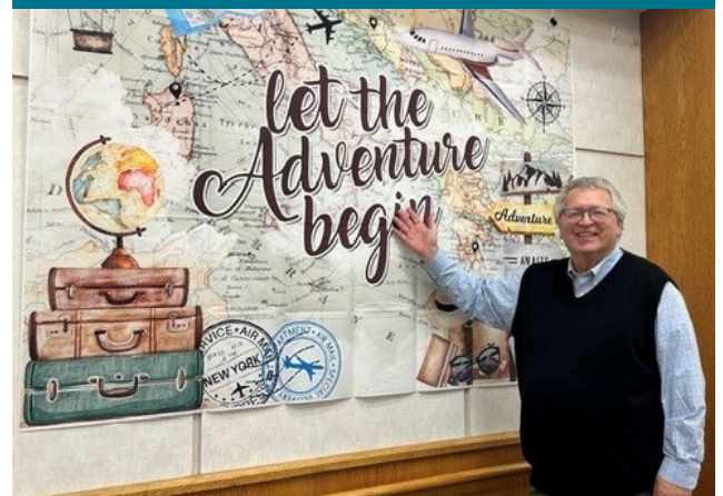
Enjoy your retirement!