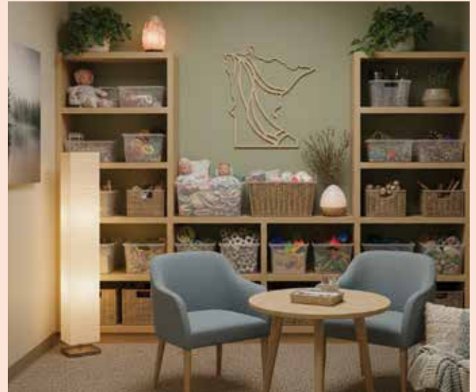
The Future Nurture Nook