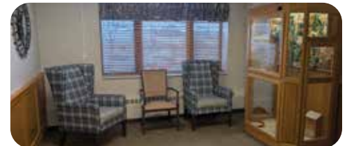
The lounges will be updated to be more inviting and cozy