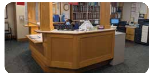
Nursing stations will be getting a much needed refresh