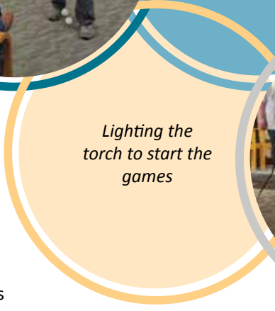
Lighting the torch to start the games