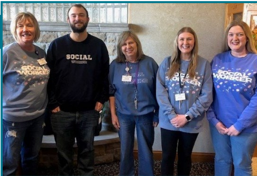
We are grateful to have you as part of the Mount Olivet Team.