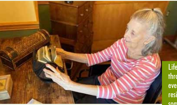
Life stations have been set up throughout the buildings and even outside. Each venue gives residents a chance to experience something that is of special interest to them.