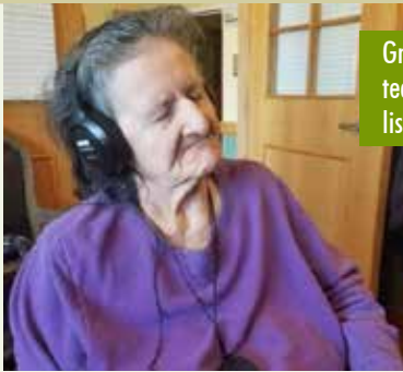
Grant funds in 2020 provided technology for residents to listen to music.