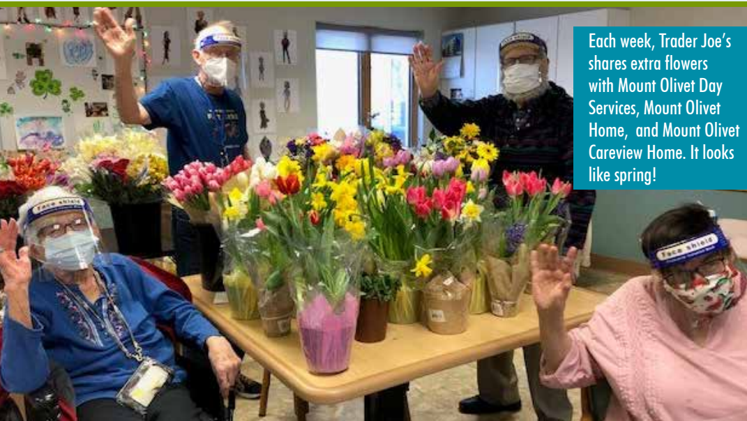
Each week, Trader Joe's shares extra flowers with Mount Olivet Day Services, Mount Olivet Home, and Mount Olivet Careview Home. It looks like spring!

Mount Olivet Day Services, Mount Olivet Home, and Mount Olivet Careview Home extend deepest gratitude to the 290 donors who contributed $226,000 at the end of 2020! Thanks!