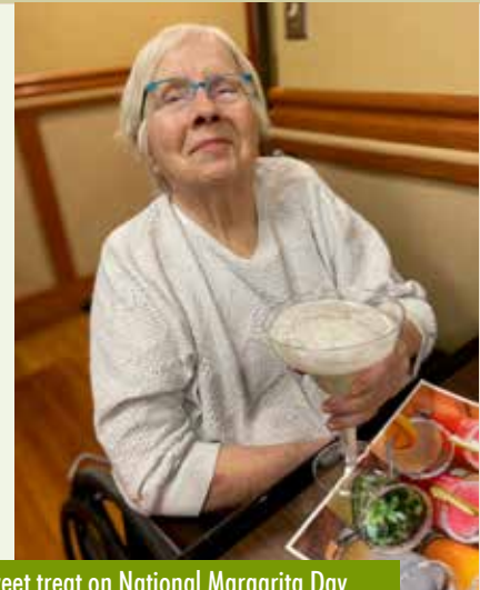
Mocktails were a sweet treat on National Margarita Day, February 22, at Mount Olivet Careview Home. Can you see the joy on their faces? Salud!