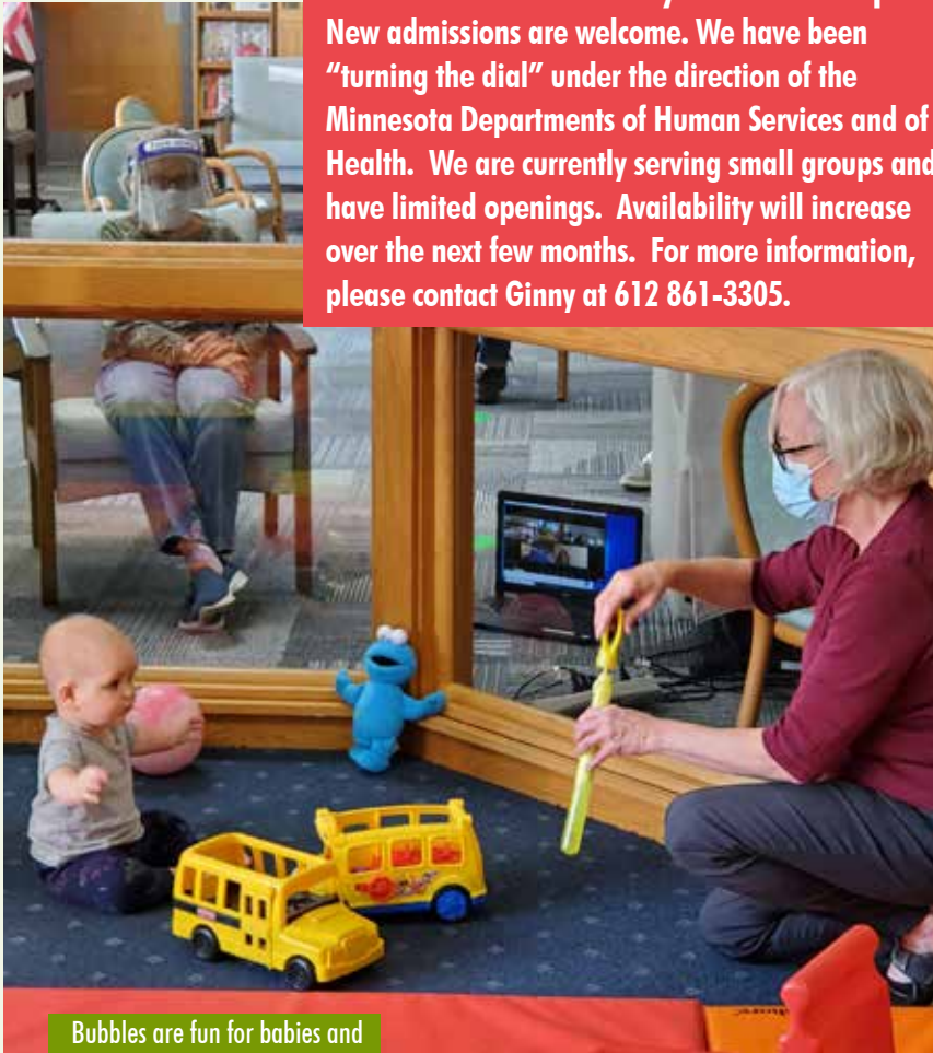
Bubbles are fun for babies and fun to watch for grandmas.