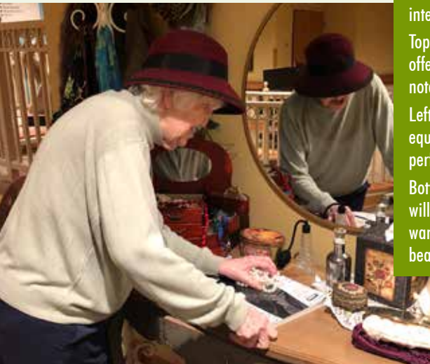
Bottom: The Patio Life Station will be popular as the weather warms, with sunny seating and beautiful plants.