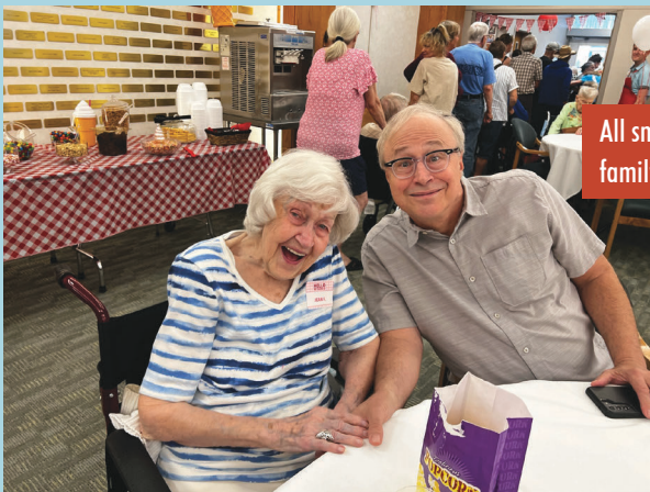
All smiles at family night!