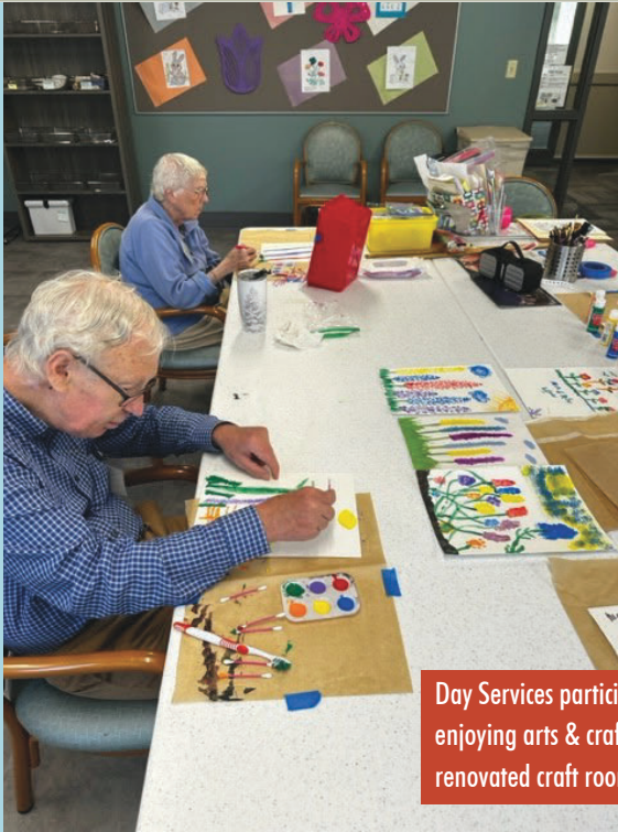
Day Services participants enjoying arts & crafts in the renovated craft room.

AT MOUNT OLIVET HOME & MOUNT OLIVET CAREVIEW HOME