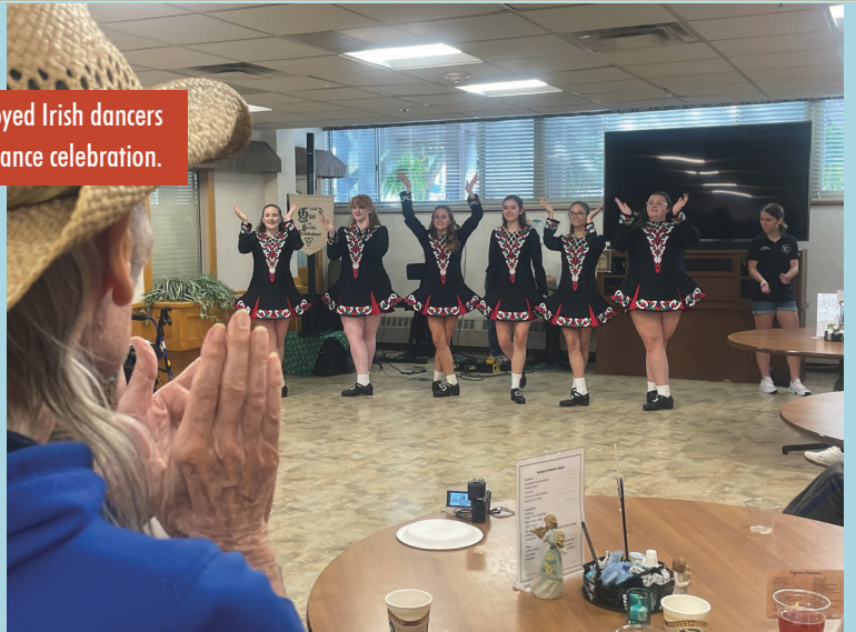
Residents enjoyed Irish dancers at our Renaissance celebration.