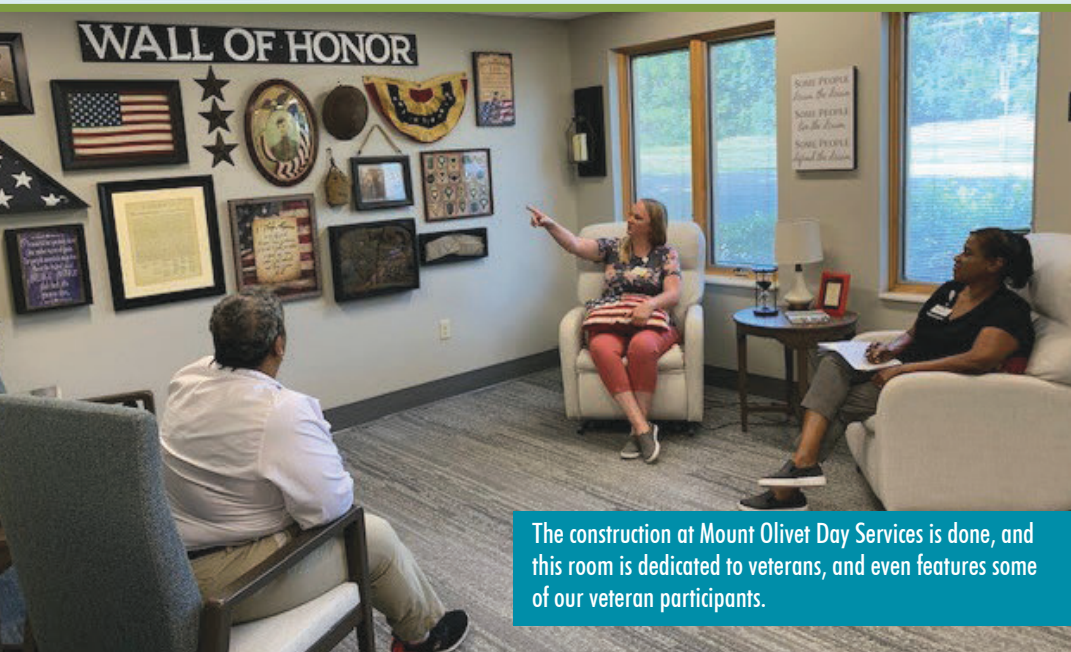
The construction at Mount Olivet Day Services is done, and this room is dedicated to veterans, and even features some of our veteran participants.