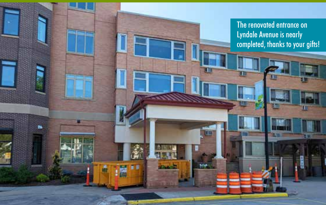
The renovated entrance on Lyndale Avenue is nearly completed, thanks to your gifts!